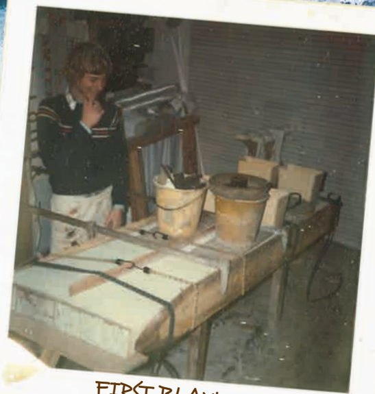
FIRST BLANK... 1972